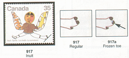
Illustration from "Canadian E.F.O.s" in the OSSC library.

To be useful, it is obviously important that members should be aware of just what is there. So, at least to begin with, I will make a point of bringing in some of the material to each meeting. I will also include some information about our holdings in the newsletter and, if I really get things together, include a catalogue in the annual calendar.